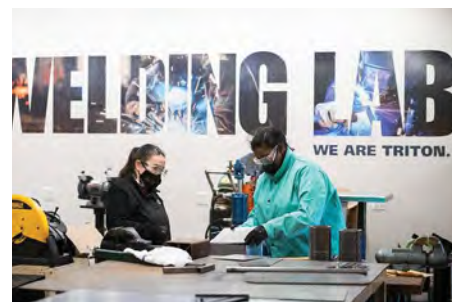
GLoW (Girls Learning to Weld) Camp Hosted by Triton College (River Grove, Ill.)

I.D.E.A. (Innovation, Design, Engineering, Automation) Academy Hosted by East Arkansas Community College (Forest City, Ark.)