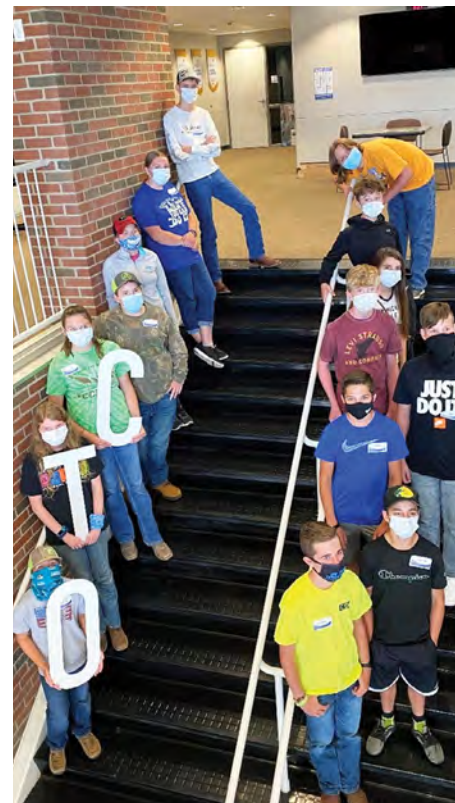
Explore Advanced Manufacturing Camp Hosted by Ozarks Technical Community College (Springfield, Mo.)